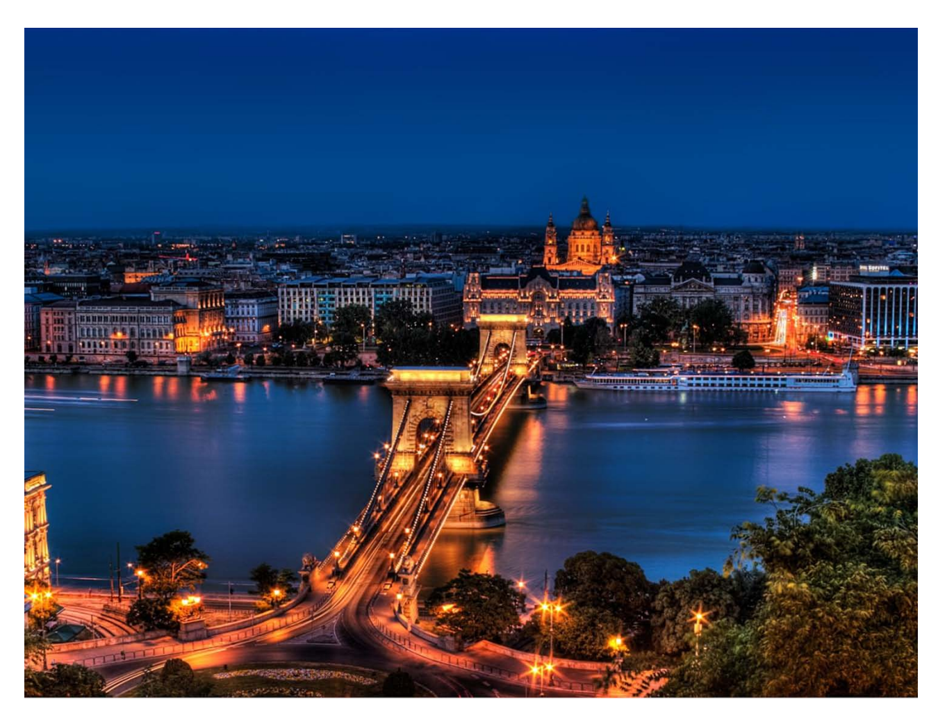
Important links: Tourist card: http://english.budapest.hu/engine.aspx?page=news&artname=20110907-cikk-budapestcard-EN http://english.budapest.hu/

Walking around the city, visitors are lured by a multitude of cafés and restaurants with terraces, particularly in the increasing number of pedestrian zones. A favoured entertainment area is Liszt Ferenc Square and its vicinity, and renewed Ráday Street. The cultural life of Budapest would be inconceivable without buoyant nights in the theatre. Many of the renowned old theatres have been remodelled over the past few years including the Operetta Theatre and Thalia Theatre. In 2002 the National Theatre, demolished in the 1960's, was rebuilt on a new site.