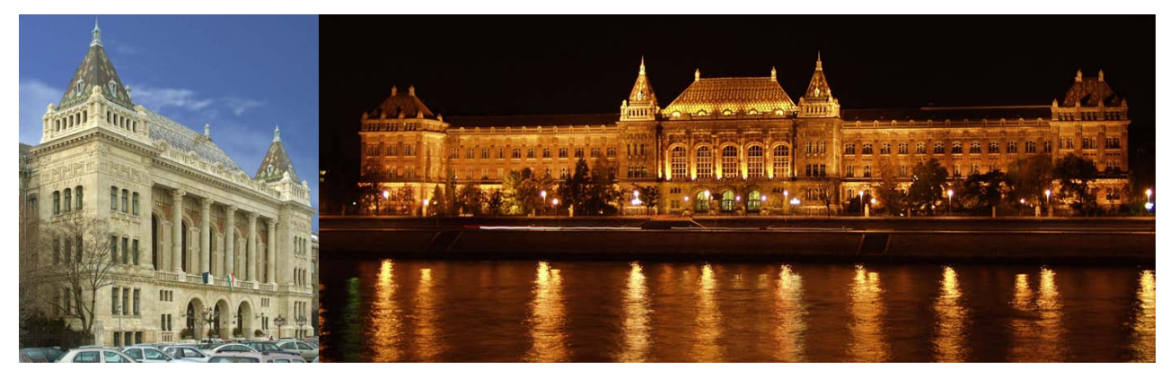
Faculty of Electrical Engineering and Informatics (VIK)

The Faculty of Electrical Engineering founded in 1949 has been renowned for excellence in research and education throughout the years of changes in the scope of engineering. Over this period, the faculty has earned a wide-spread international reputation for its high academic standards and scientific achievements. Spearheading the movement to establish a modern education system, it has offered a comprehensive English curriculum since 1992. In its 9 departments, the education programmes in English include a 3.5-year B.Sc., a 2-year M.Sc. and a 3-year Ph.D. programme in the fields of electrical and software engineering. Applicants with B.Sc. studies having a WGAP (Weighted Grade Average Point) equal or better than 'good' (more than 3.51 out of 5.00) will receive acceptance to the M.Sc. course, which further advances the knowledge obtained in the undergraduate programmes in the same two fields: Electrical Engineering, offering specializations in embedded systems, infocommunication systems, and electrical machines and drives; or Software Engineering, offering specializations in applied computer science and system development, also Business Information Systems, offering specialization in Analytical Business Intelligence.